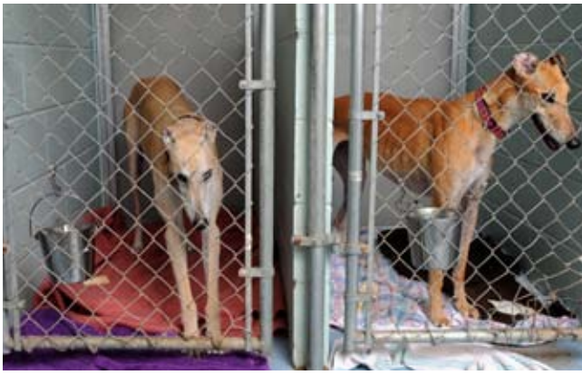
Kennel photo of Naughty