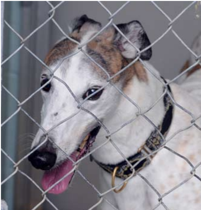
Kennel photo of Doc