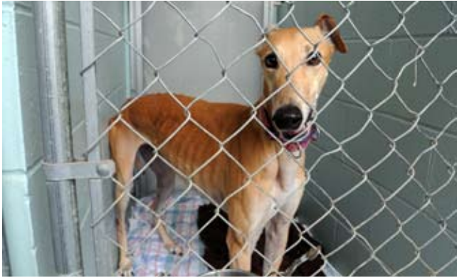
Kennel photo of Naughty