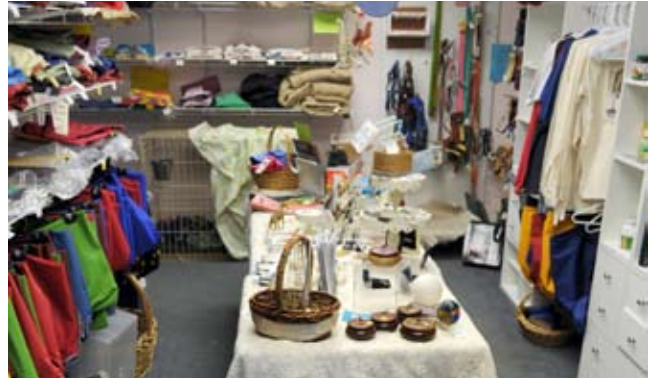
The Homeward Bound Hound Boutique